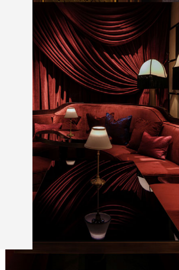
VELVET BY SALVATORE CALABRESE